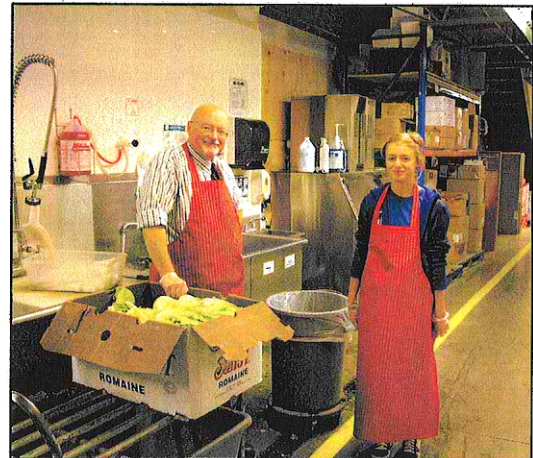
Take a Grade 9 Student to work.