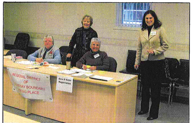
School Trustee Advance Poll – Grand Forks.